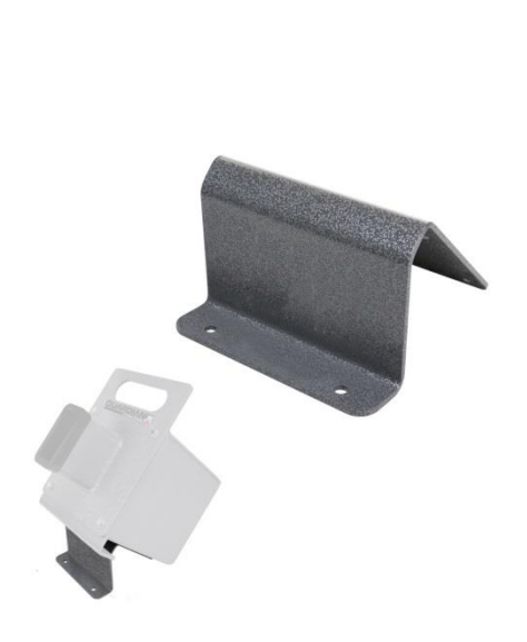
Guardian Jr™Desk Mount Option SKU TP5094