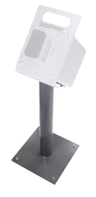
Guardian Jr™ Floor Stand Option SKU TP5092