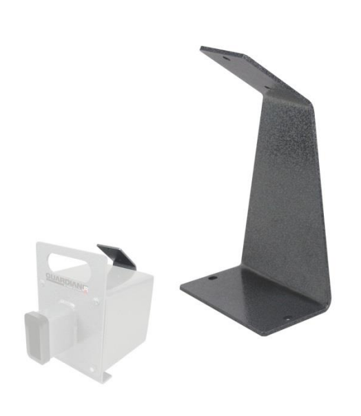
Guardian Jr™ Wall Bracket Option SKU TP5093

Guardian™ Clearing Traps are designed first and foremost to certify the safety of those using it, and provide maximum durability to ensure performance for years to come.