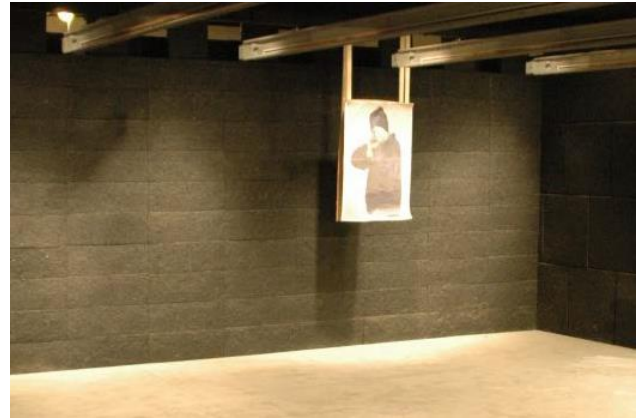
Figure A. Section view of Range Systems Encapsulator™ Wall System. Constructed of AR500 steel, Dura-Panel™ and Dura-Blocs™ with proprietary compression system.

Range Systems Dura-Bloc™ EXP rubber composite product virtually eliminates the hazards of ricochet and splatter, minimizes airborne lead contaminants, and offers ballistic capabilities no other material can match. Although the use of tracers is prohibited, independent testing has verified that EXP® ballistic rubber contains properties that reduce the risk of fire from isolated exposure to a low volume of tracers. The test results also confirm that EXP® composite rubber has fire extinguishing properties. No other company can make this claim about their ballistic rubber and support it with test results.