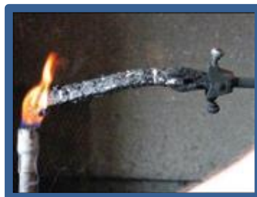
EXP® Rubber 30 second bunsen ignition

3. Product has been tested and approved through the Research and Development unit for Materials and Equipment for the US Army, Combat Applications Group, Fort Bragg, NC.