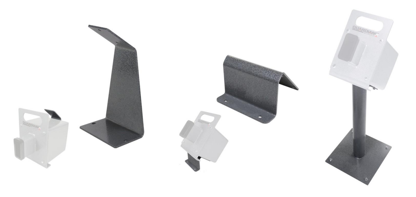
Guardian Jr™ Wall Bracket Option SKU TP5093

Guardian™ Clearing Traps are designed first and foremost to certify the safety of those using it, and provide maximum durability to ensure performance for years to come.